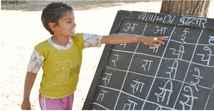
Fig. 67: Understanding through education

Thinking holistically is good—living holistically is even better! I consider this to be the greatest challenge for all of humanity: to establish schools worldwide—schools that guarantee a thorough general education for all of us. “General” means that instruction would not be permitted to be influenced by any ideology, but it would compare political and religious convictions objectively. To fulfill this high aspiration in good faith, public and clerical school officials must renounce all political and missionary doctrines or goals. Only in this way can the young generation recognize for itself how valuable democracy and freedom of religion really are. And only in this way will things succeed to abolish hatred in the world and to strengthen our sense of community. Education should always be about experiencing things for oneself. This is why I do not offer any new religion in my books, but I encourage you to thresh out your own world view to discover any inconsistencies.