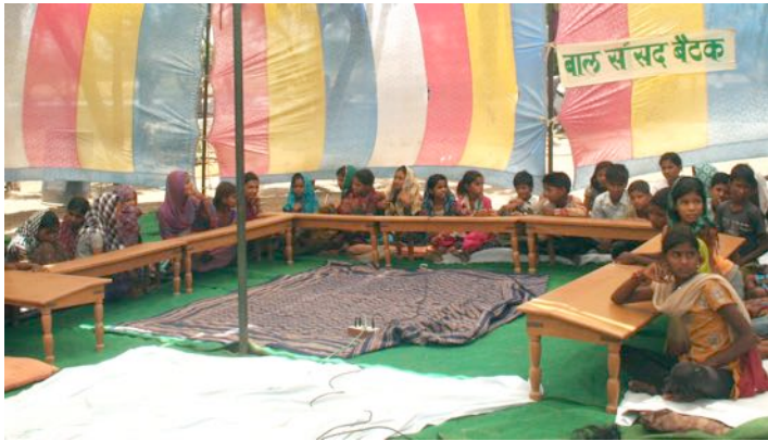
Fig. 69: The children's parliament

Social studies, science, math, Hindi and English are all taught. The children's progress is checked every month. Additional courses prepare the children for transition to public schools. One special feature is the establishment of a children's parliament which is re-elected every two to three years. This parliament benefits understanding of democracy for the children, and it takes on the important task of carrying out quality control for the school in regular intervals with a committee of villagers.