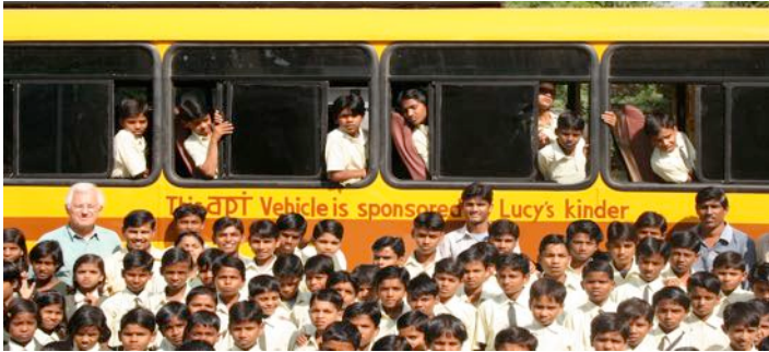
Fig. 70: All donations go directly to the children