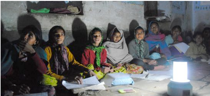
Fig. 66: Night school for children in India

Non-profit foundations can beat self-delusion—without the red tape. They promote projects that benefit society. Who can pass on love and understanding to others? Only those who have experienced love and understanding themselves! The willingness to commit yourself for the benefit of others must start at a young age—in the schools! Lucy's Children Foundation wants to open doors to love and understanding for poor children too: Love through affection, understanding through education. If these children think in the same way when they are older, even the smallest contribution will multiply and bear fruit for the future.